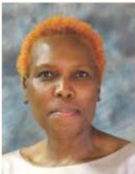
Motlalepula Rosho Finance