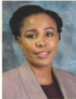
Keneetswe Mosenogi Economic Development, Environment & Tourism