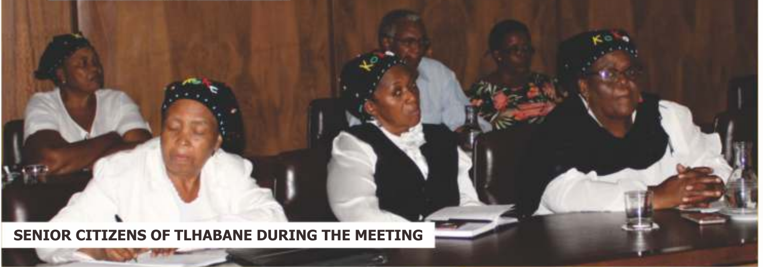
SENIOR CITIZENS OF TLHABANE DURING THE MEETING